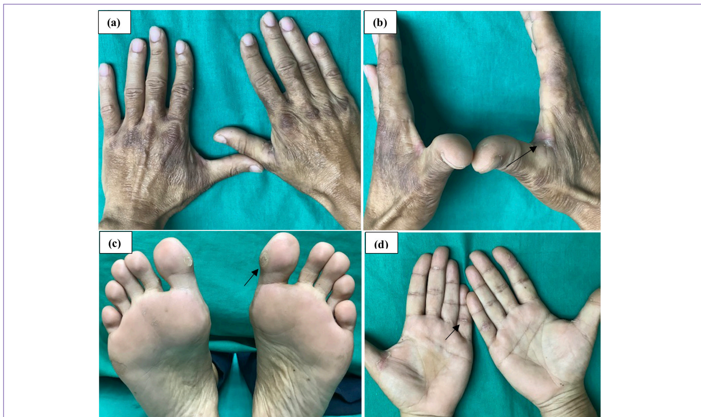
Figure 3. After 3 weeks of stopping sorafenib therapy and mometasone once daily application, decrease in erythema [shown by arrow on (b)] and reduced size of callosity [shown by arrow on (c) and (d)] was noted