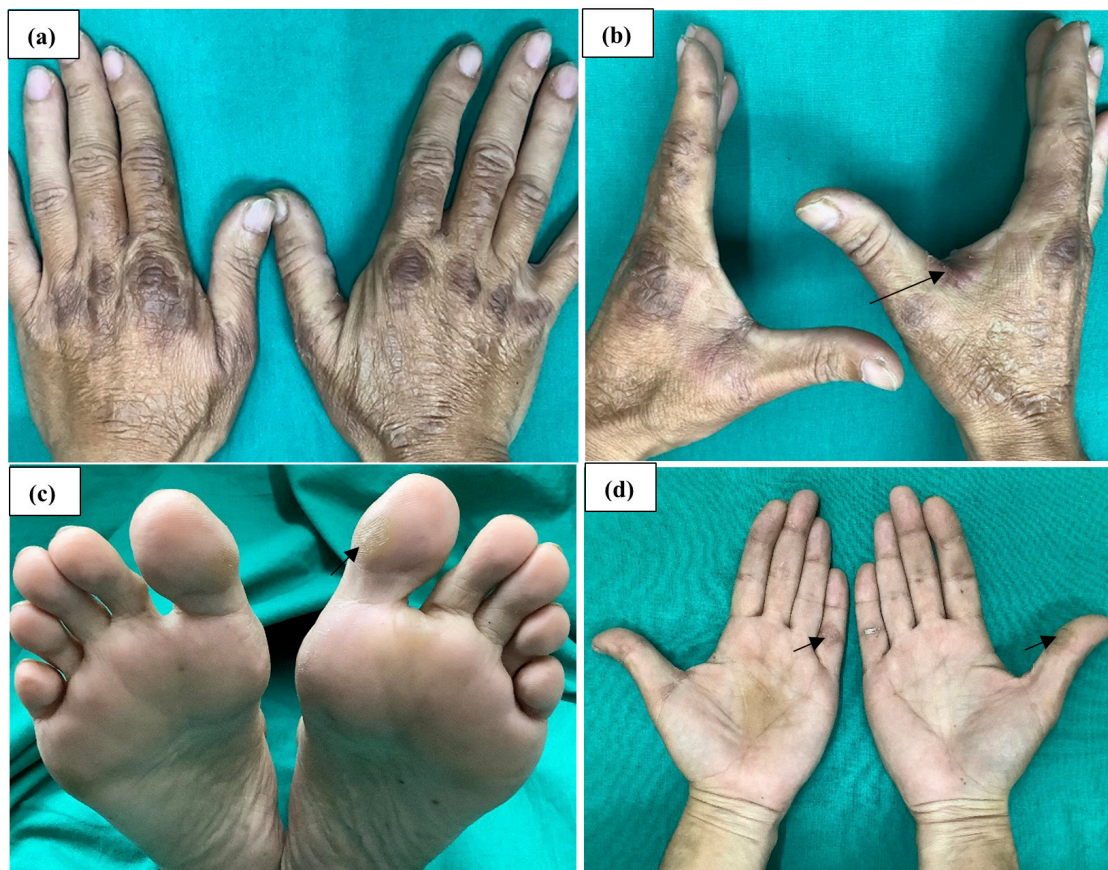
Figure 1. Erythematous plaques over the knuckles (a), and around base of the thumb (b). Callosity on the great toe (c) and hand (d)

Sorafenib is a novel small molecule which is widely used as an anticancer agent. It directly prevents proliferation of cancer cells by inhibiting Raf/MEK/ERK pathway and also blocks tumour blood supply by targeting vascular endothelial growth factor receptor (VEGFR)-2, VEGFR-3 and platelet-derived growth factors receptors (PDGFR) [2]. Dermatological side-effects like acne, hair loss, flushing, HFSR, desquamation etc is seen in approximately 90% patients [5]. In one case series, HFSR was reported in 78% of patients receiving sorafenib. Among them, 11% had grade 1 HFSR while grade 2 and 3 were found in 33% each [6]. Risk factors of HFSR include female gender, tumour type, liver metastasis, normal pre-treatment white cell count etc. [7]. HFSR usually develop within first six weeks of initiating treatment [3]. In one study, mean duration of onset