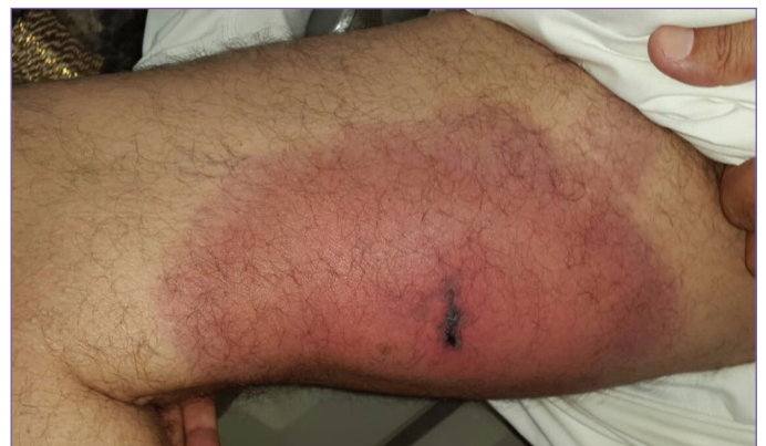
Figure 1. Twenty-six year old male with early lesion as a cellulitis like spider bite after four days affecting the inner aspect of right thigh showing small central necrotic area on the top of well-defined erythematous plaques and cellulitis like picture

These two spiders were not reported in Iraq and neighboring countries like Iran and Turkey [25] but after American occupation of Iraq in 2003, these spiders were suspected to be present as results of seeing of strange cases of skin bites and these were increased in their frequency after 2013. Since then these spiders where documented to be present in Iraq both the black and brown spider [8,9,12]. And as all reported cases presented with spider bites rather than with systemic manifestations, we can assume that this skin problem is caused by brown rather than black spiders. This in agreement with other study where the causative spider is rarely seen for identification [26].