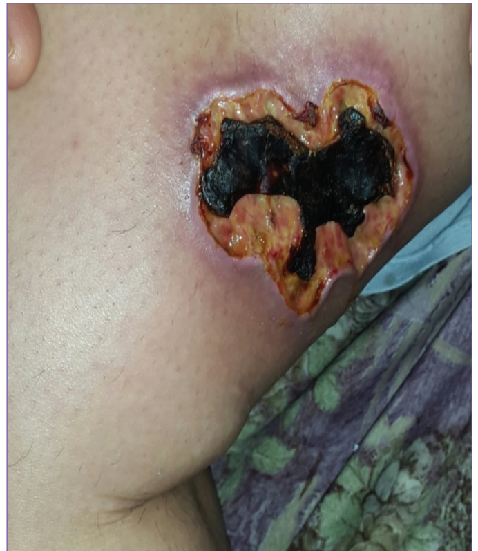
Figure 3. Thirty year old female pyoderma gangrenosum like spider ulcer affecting the right thigh and showing a well-defined deep ulcer with polygonal irregular margin

Histopathology was not carried out for any patient, as biopsy was refused by patients. In addition, the biopsy may exacerbate the acute condition of the spider bite ulcer.