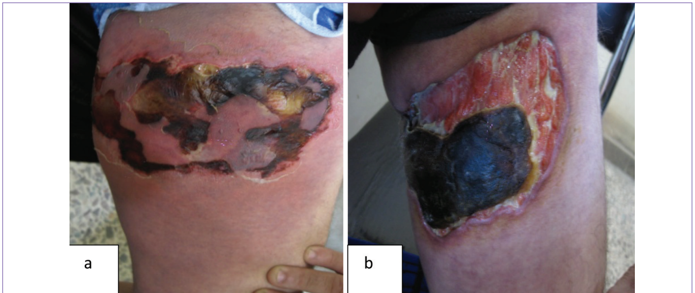
Figure 4. Thirty-one year old male with spider showing pyoderma gangrenosum like after ten days (a) and after three weeks (b) following therapy