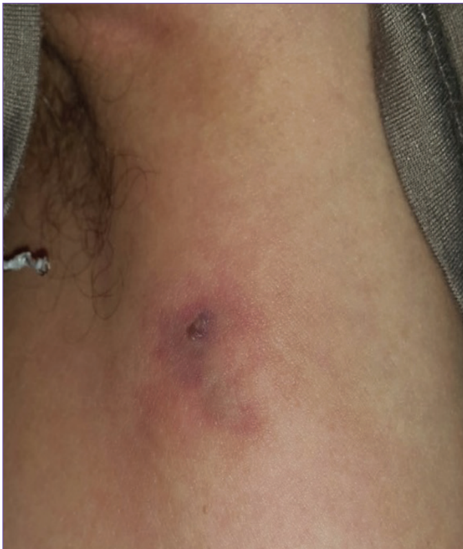
Figure 2. Twenty-five year male patient with spider bite affecting the border of left axilla and showing cellulitis like erythematous plaque with small central necrotic area

The presence of black gangrenous area at the center of cellulitis like lesion due to spider bite which is most important diagnostic feature to differentiate cellulitis like due to spider bite from ordinary bacterial cellulitis.