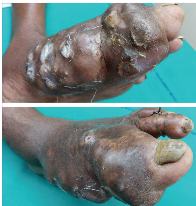
Figure 1. 8 cm x 6 cm sized nontendered swelling with multiple sinuses discharging

A 48-year-old male, farmer by occupation, came to Dermatology Outpatient Department with six years history of painless swelling of left foot which was progressive in nature. He had history of working barefoot in the field. Cutaneous examination revealed 8 cm x 6 cm sized nontendered swelling with multiple sinuses discharging serosanguinous fluid and black granules (Figure 1). The black granules were soft in consistency and their shape and size were variable (Figure 2). Webspaces of left foot was normal. There was no regional lymphadenopathy. No other abnormalities were found in left foot. Rest of the cutaneous examinations were normal. General and systemic examination were unremarkable. Standard X-ray of his foot showed no bony involvement. Laboratory tests revealed no abnormalities in hemogram.