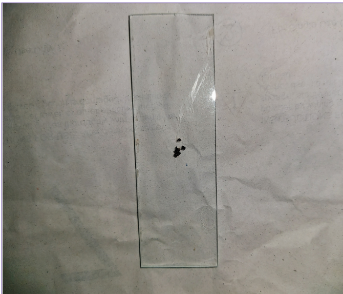
Figure 2. Black grains of various sizes and shapes

Eumycetoma is a chronic granulomatous disease caused by fungus presents with tumorous swelling, multiple discharging sinuses and black grains. Tropical eumycetoma is frequently is