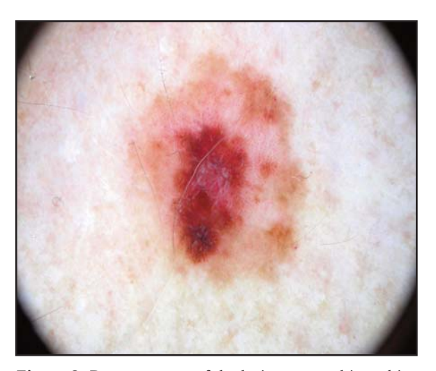
Figure 2. Dermatoscopy of the lesion; note shiny white streaks and veil on the center with dotted vessels peripherally.

Melanoma arising in a nevus is mainly a histopathological finding rather than a clinical diagnosis. In a recent study, histopathological evidence of an associated nevus was reported as 29.3% in all melanoma cases [1]. However, except for association, there have been only a few reports of melanoma arising in nevus, recently. After a case of melanoma within an intradermal nevus reported in 1994