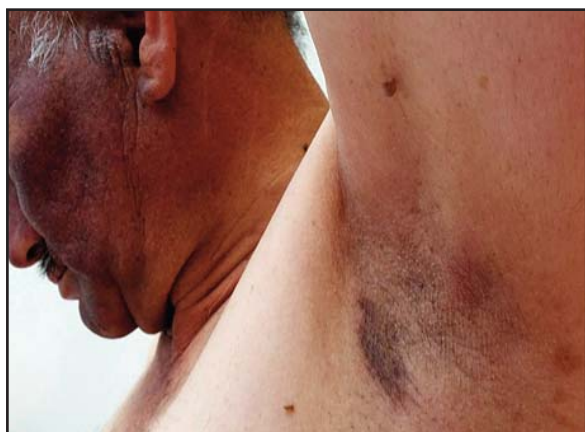
Figure 2. Hyperpigmented patches on the axillary area

no case studies in the literature about development of secondary pigmentations in the sun-exposed areas and axillar area during combined peginterferon alpha-2a and ribavirin treatment. We put forward a case report about the development of secondary pigmentation in the sun-exposed areas and during combined peginterferon alpha-2a and ribavirin treatment of a HCV infection.