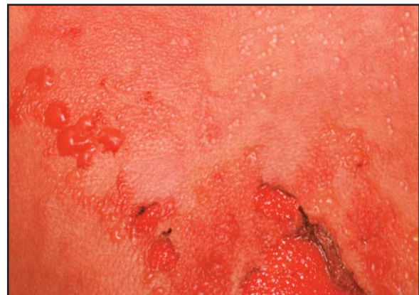
Figure 1. Multiple, tense vesicle-bullae, erosions on urticarial plaques, and multiple, discrete, firm, white, 1-2-mm papules on the trunk.

healed crusts developed, followed by dissipation of the crusts and small point-like white formations. The patient's parents were not consanguine and they reported a negative family history of genodermatoses. Physical examination showed multiple, tense vesicle-bullae, erosions on urticarial plaques surrounded by hypo-hyperpigmented macules, and multiple, discrete, firm, white, 1-2-mm papules on the trunk.