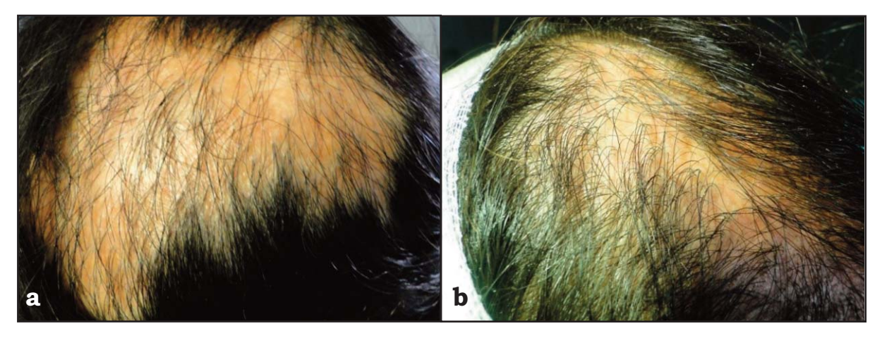
Figure 3. a) Pre-transplant picture; b) 1 year post transplant picture

treatment in these patients. In recent times, hair transplant has emerged as a promising and effective mode of treatment in patients of alopecia. However, in cicatricial alopecia, stability of the disease is an important consideration prior to providing the patient with the option of a hair transplant. A two year disease free remission is considered a prerequisite before taking up the patient for surgical treatment.