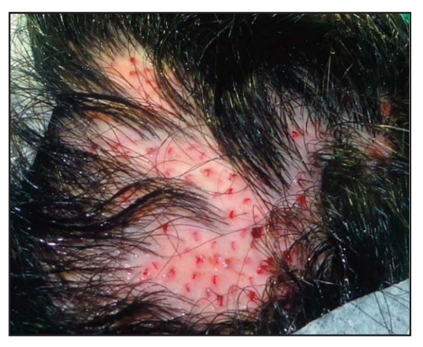
Figure 2. Implanted follicular units into the bottom of the micro-slot