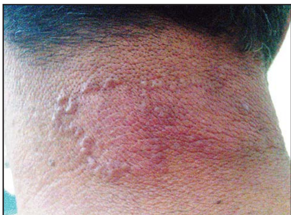
Figure 1. Annular erythematous lesions on the nape of the neck