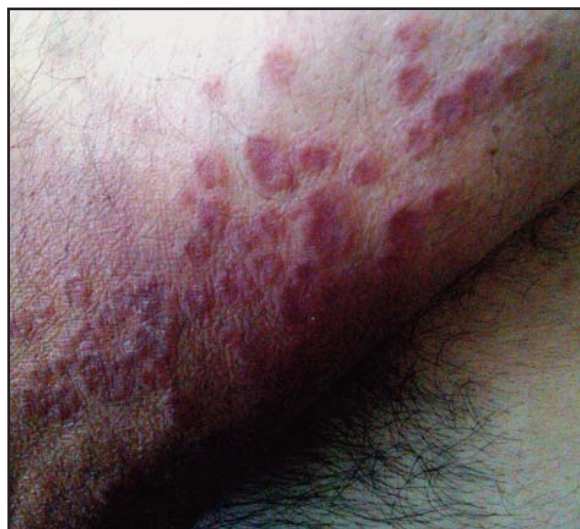
Figure 2. Annular erythematous papules and atrophic plaques with elevated border and on the arm