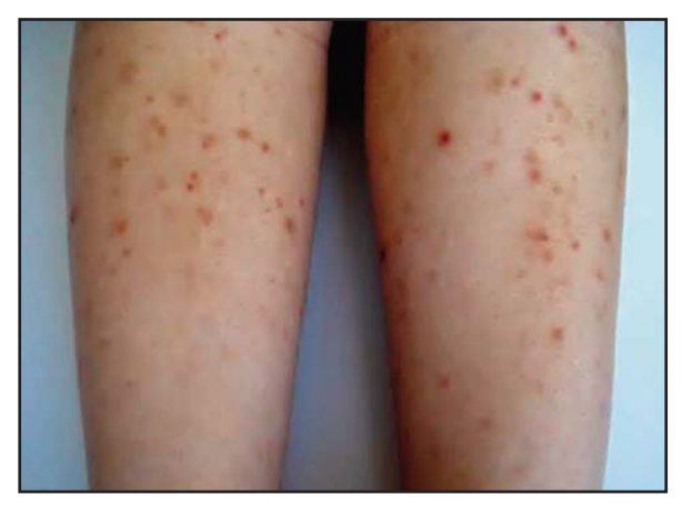
Figure 1. Erythematous papules and hyperpigmented macules on her legs

or infections and was otherwise healthy. She reported that pruritic papules appeared within 15 days after giving birth to her first child by cesarean section, six months ago. While papular lesions