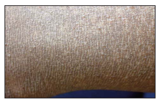
Figure 1. Ichthyosis on the forearm

nancy. Ichtyosis was present at birth, but there was no history of a collodion baby. In early childhood period, photosensitivity and poikiloderma had appeared on the face.