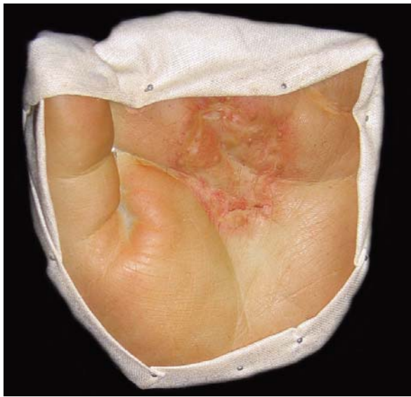
Figure 2. Wax model of a tinea manum case (Top).