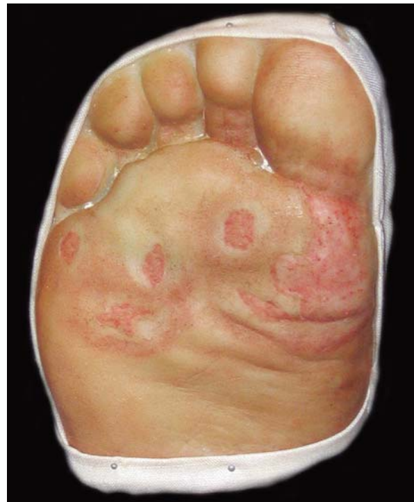
Figure 3. Wax model of a tinea pedis case (Right)

and interdigital areas obtained by microscopic examination and culture, and he declared these cases at French Society of Dermatology and Syphilography and published in Bulletin de Societe Francaise de Dermatologie et de Syphilographie and Annales de Dermatologie