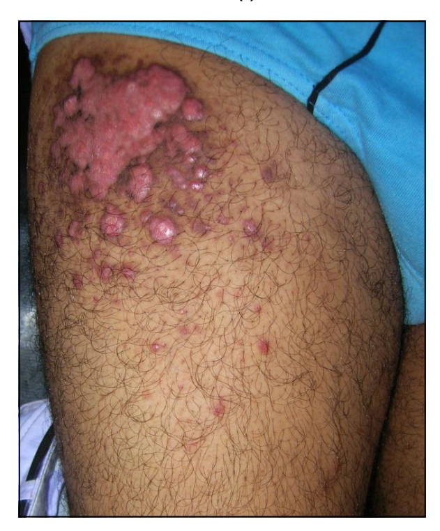
Figure 2. Multiple plaques over lateral aspect of the right thigh